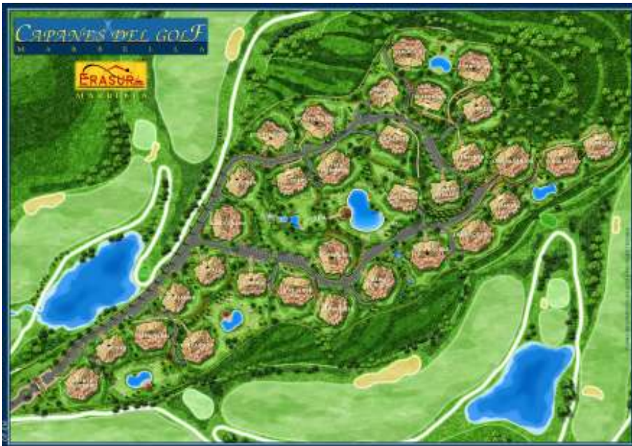
Capanes del Golf - Development